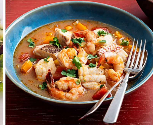
Caribbean-Inspired Seafood Stew. Not my photo, which I forgot to take. But a good likeness.