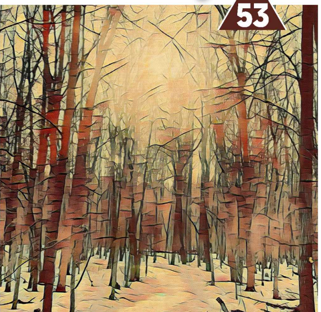
Another Photoshop doodle.